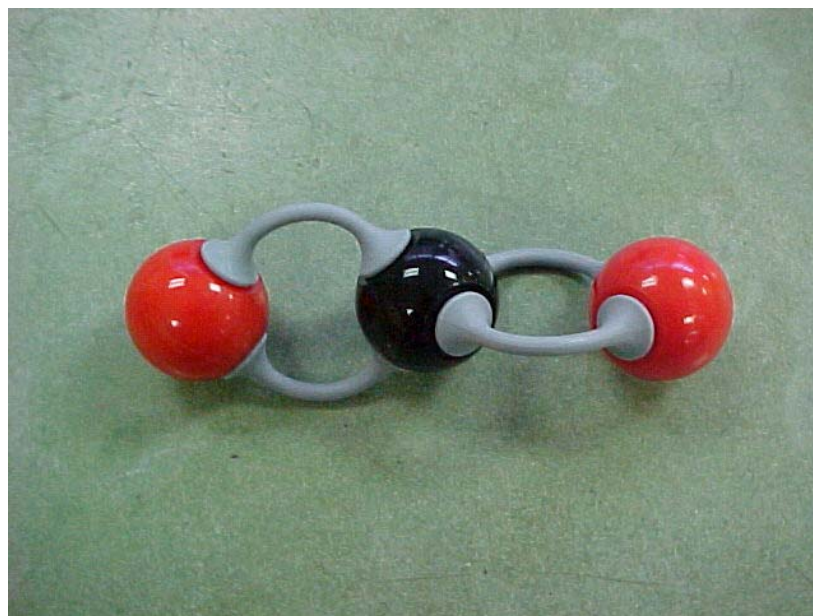
3-D structure of the carbon dioxide molecule